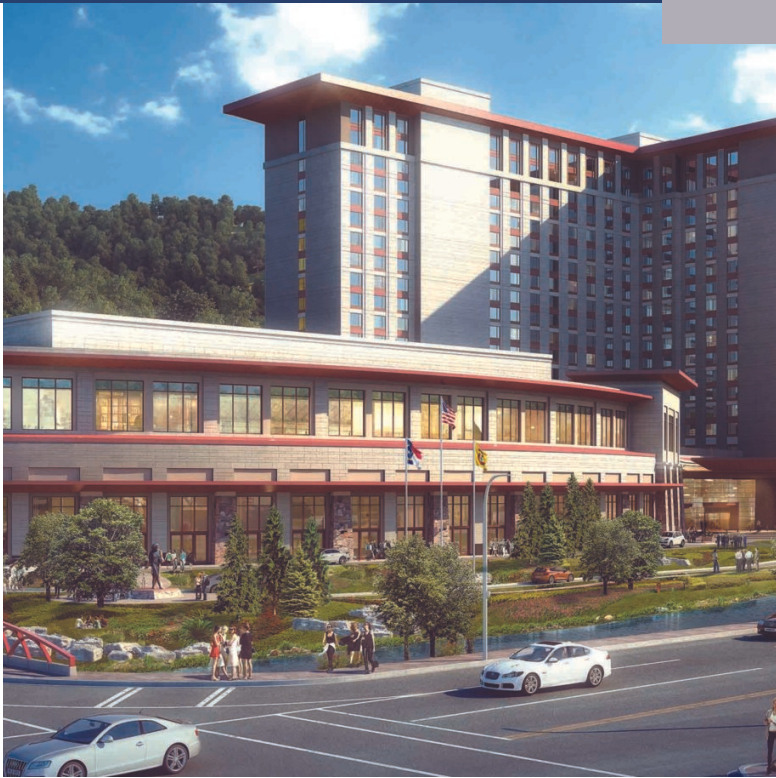
Harrah's Cherokee Casino & Resort