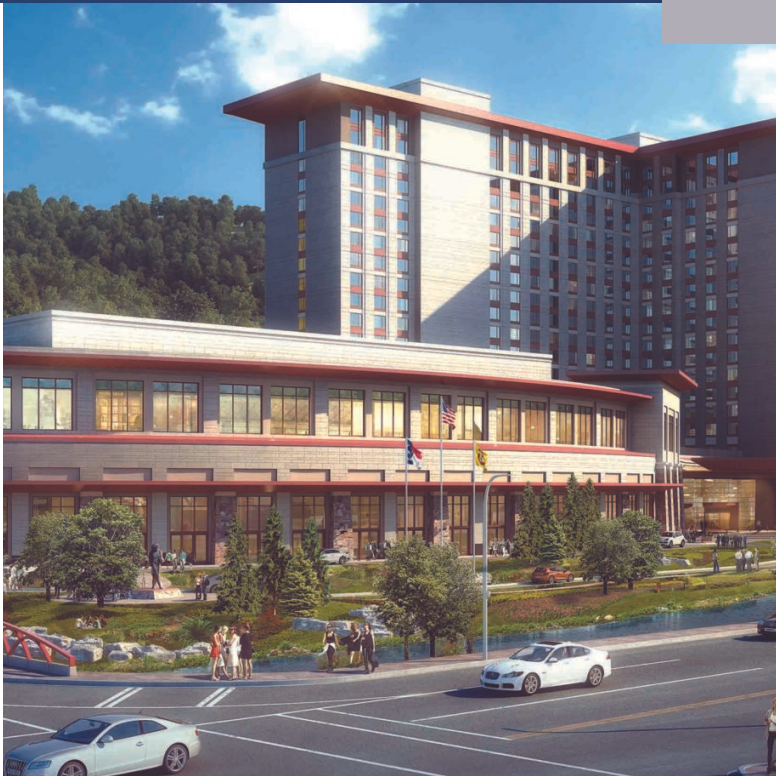
Harrah's Cherokee Casino & Resort